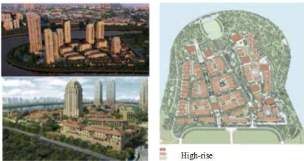
Figure 2. Example of an LEED-ND 2 Project Neighborhood – Heart of Lake, Huixdand Islands, Xiamen, China.

The BREEAM Communities tool covers five major categories: Social and economic well-being – Land and habitat use – Transport and movement – Resources and energy – Management.