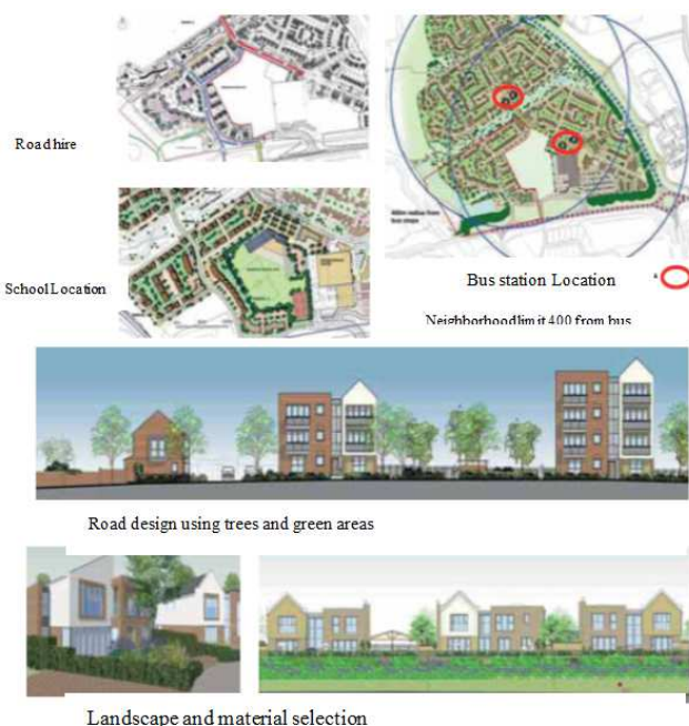
Figure 4. Milton Keynes, Buckinghamshire, England Project, Source: http://www.builtforlifehomes.org/schemes/go .

A UAE initiative, the Pearl Community Rating System is an assessment tool that aims to promote sustainable development and improve the quality of life. The tool is suitable for development projects that support at least 1000 persons within a permanent residential community [12].