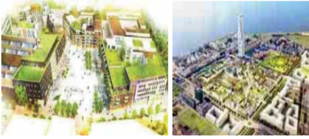
Figure 3. Example of a Neighborhood where the BREEAM Communities Project was Applied –Malthusian Project, Malmo, Sweden, Source: http://www.breeam.org/page.jsp .