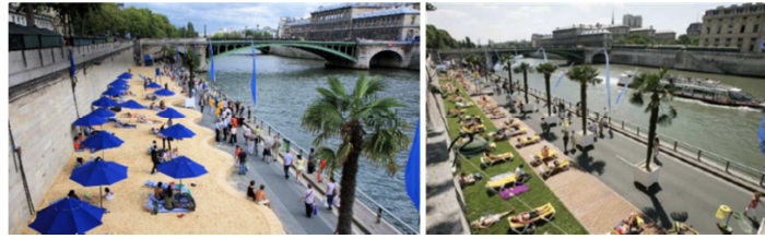
Figure 5. Organization of the Seine embankment, Paris. Paris Beach Project.

areas for children, recreation areas was formed here (Figure 5. Paris, France, 2013).