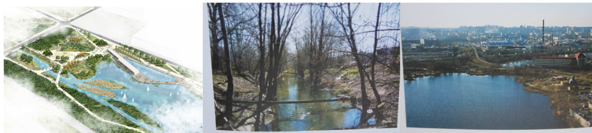
Figure 3. Pochayna River. Ukraine. Project to organize Pochayna Park in Kyiv.

The Jordan Stream, Pochayna's most famous tributary, flows at the foot of Mount Yurkovytsia [18]. The winner of the all-Ukrainian competition was the project of creating a park with revitalization of some sections of the river Pochayna: raising part of the river to the surface in the area near Lake Jordan, releasing the river from a concrete tray in another area, the natural channel Pochayny should clear, restore ecotonic component. To implement the project, it is necessary to agree on land management, enter into an agreement with the authors of the project and, most importantly, allocate sufficient funds. For example, $ 380,000,000 was spent on the revitalization of the Chongcheong River [19].