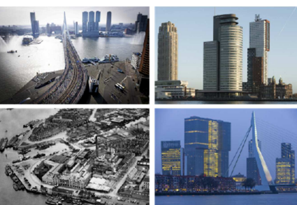
Figure 1. Organization of the coastal area. Rotterdam. Netherlands.