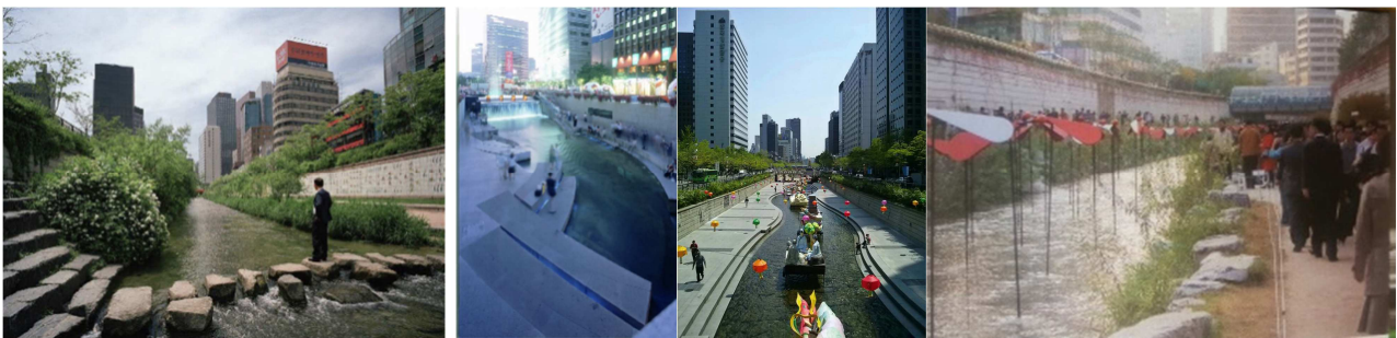
Figure 2. Revived Cheoncheon River. Seoul. South Korea.

Despite the usual criticism and skepticism, in 2003 the project of the architectural firm Seo-Ahn Total Landscape was approved. During the 2 years of ongoing revitalization, hydraulic works were performed, air bridges were built, underground connections between the shores, the coastal area was turned into a valuable area of public space. The 6 km pedestrian promenade has been divided into several walking routes: the Garden of Stones, an area with reproductions of works by 18th century artists, an area of contemporary artists, a historic site with a presentation of ancient Seoul life, the Wall of Desire, where residents live. Seoul is carving out its dreams. City holidays, parades, fairs are held on the embankment (Figure 2).