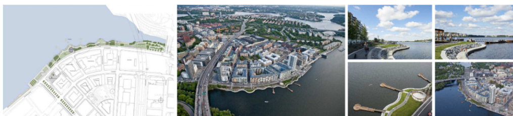
Figure 4. Coastal Organization, Stockholm.