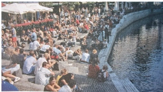
Figure 6. Revitalization of the Aarhus River, Denmark.

Interesting large-scale integration projects in the formation of coastal areas are also [8-14]: